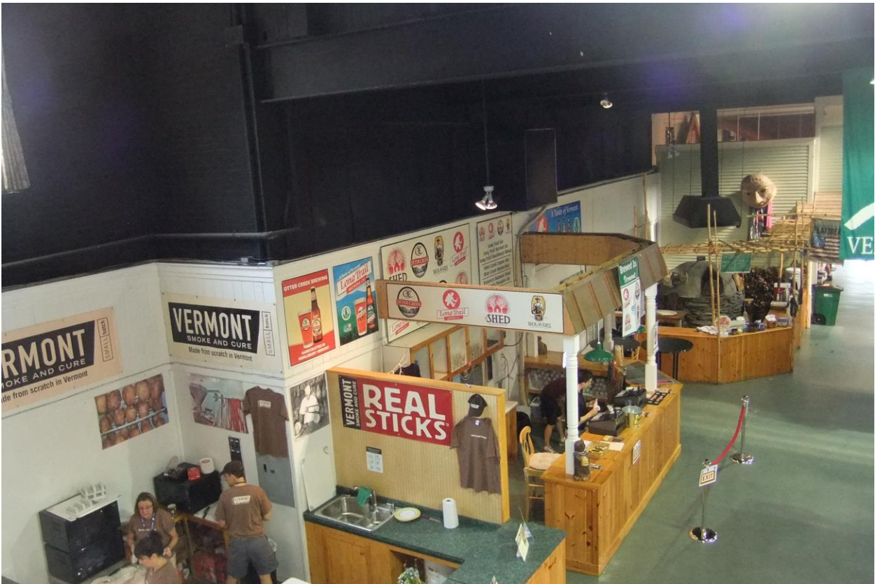
Before New Energy Efficient Lighting & Air Handler Work & Black Painted Ceilings.