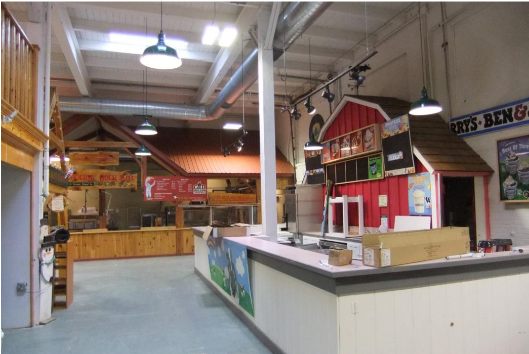
After New Energy Efficient Lighting & Air Handler Duct Work Installed.