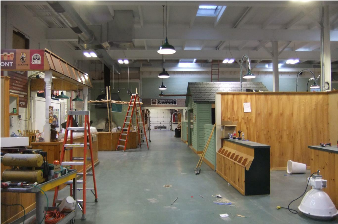
Before New Energy Efficient Lighting & Air Handler Work & Painting.