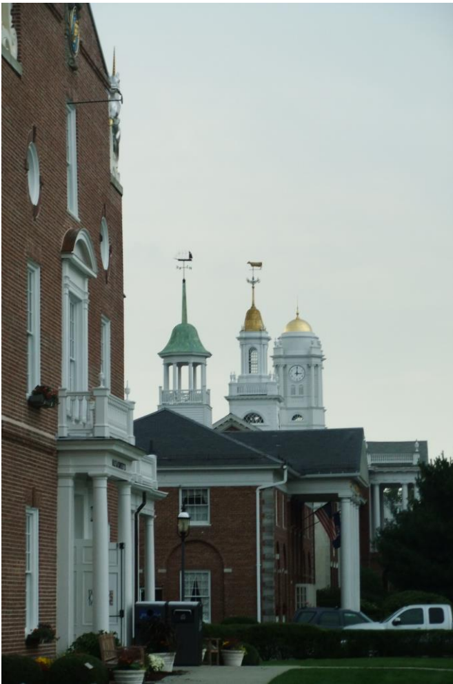
RE-Gild Vermonts Dull Dome