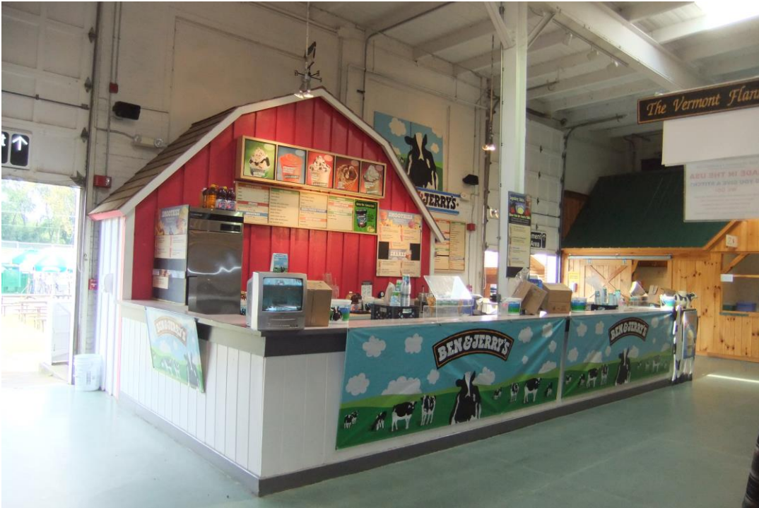
Before Energy Efficient Lighting & Air Handler Duct Work Installed.