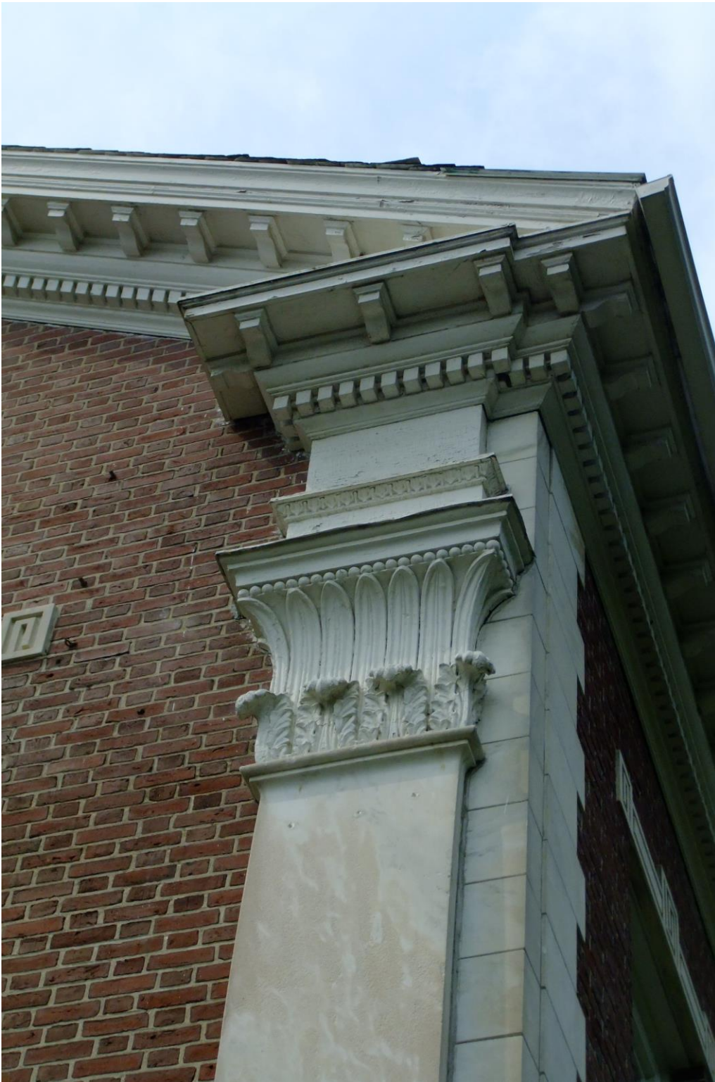
Marble Pilaster Separating from Building Facade