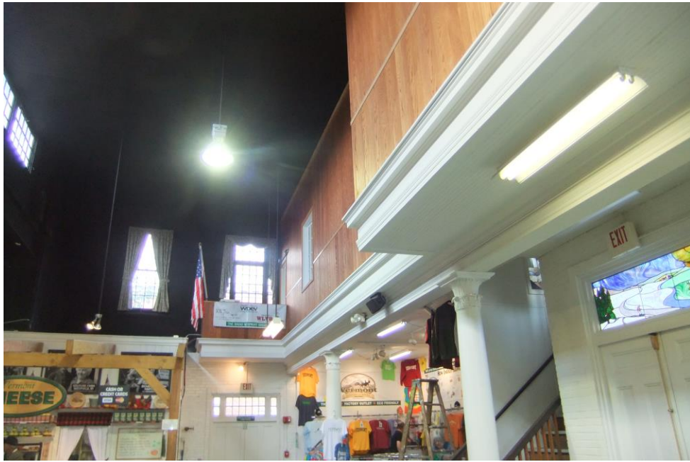
Before New Energy Efficient Lighting & Mechanical