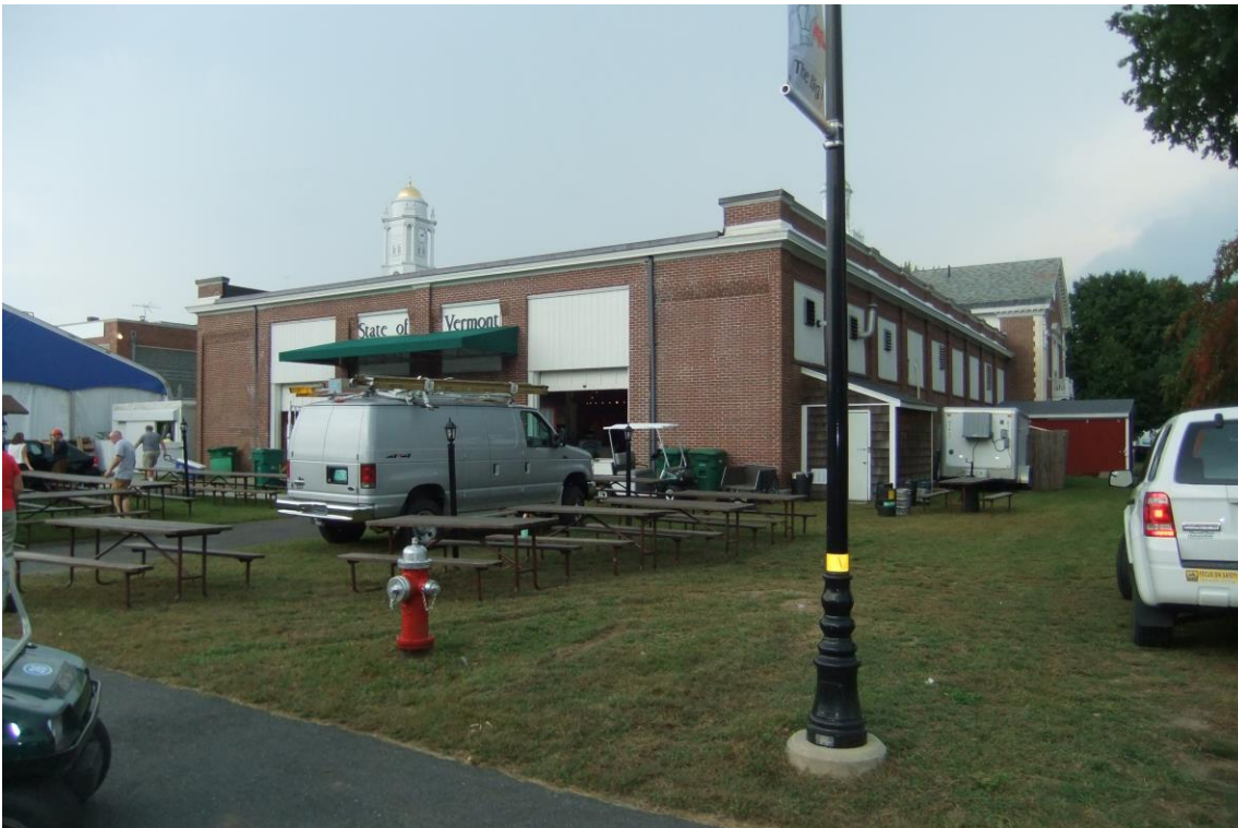
Existing Back Entry slated for the following work: window restoration, lawn drainage, restore entry doors, upgrade landscaping and fabricate new Band Pavilion.