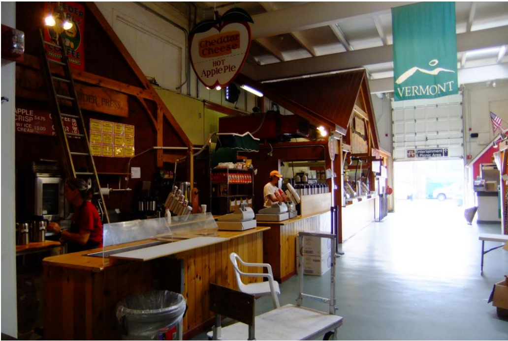
Before New Energy Efficient Lighting & Air Handler Duct Work Installed.