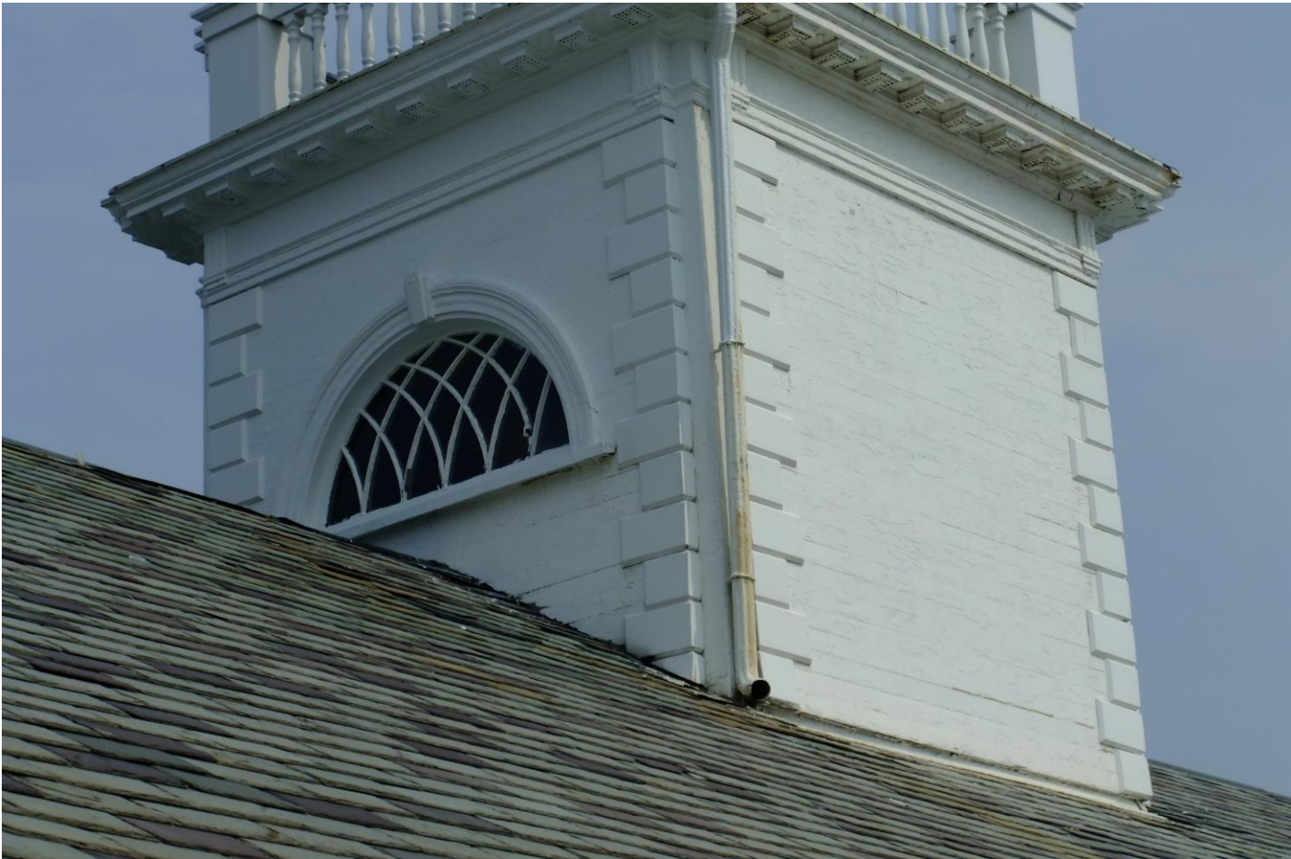
Restore Cupola Windows Walk and Deteriorated Trim