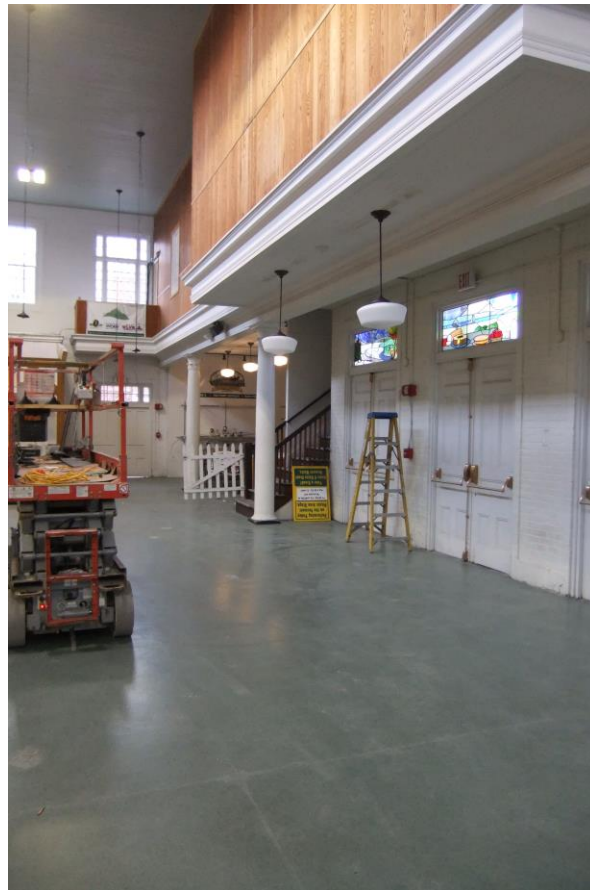
Progress on the installation of New Energy Efficient Lighting and Painting of Black Ceilings